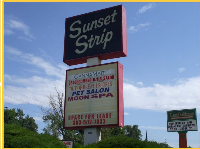
FRONT - Faces North - Toward Arapahoe Road