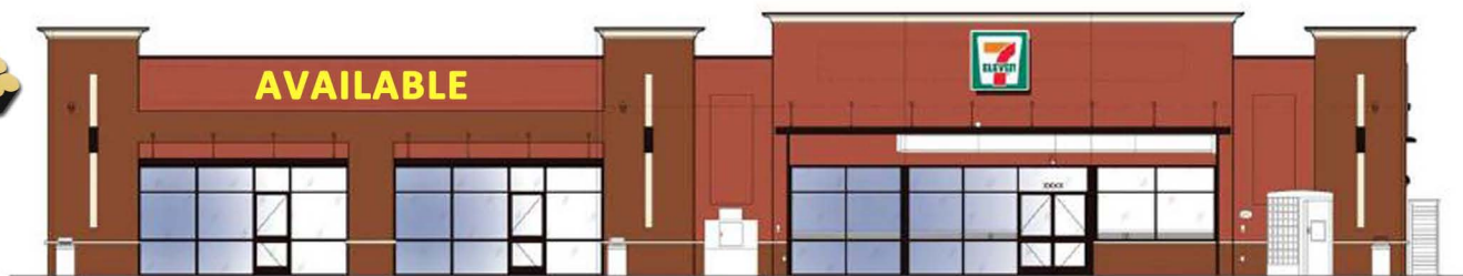
01 SOUTH ELEVATION (FRONT)